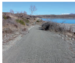
Smooth Shingle (35%)

Trail route and weather conditions subject to change. Please check website before daily departure.