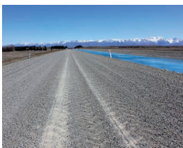
Gravel Road (19%)